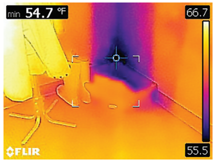
Area box with Cold Spot demonstrates air infiltration