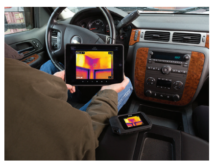
Upload images to FLIR Tools over Wi-Fi